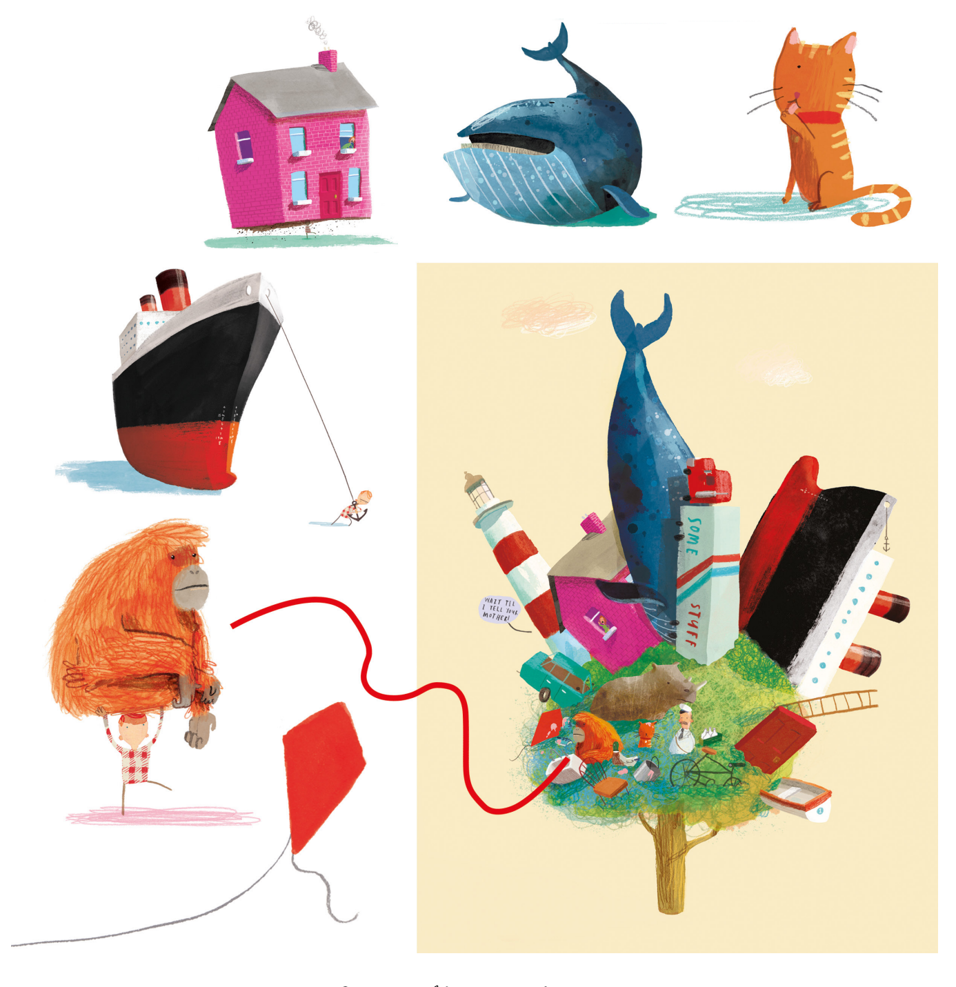
Discover more fun and games at www. oliver Jeffers World. com